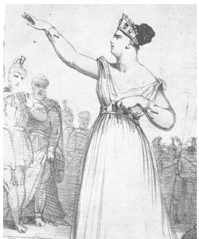
Giuditta Pasta as Medea in London in 1826

These notices did not stress that she had a supporting cast of some of the greatest singers of the age: in the first instance the basso role of Creonte was sung by Carlo Porto (in later revivals he was replaced by Luigi Lablache); the high tenor role of Egeo was sung by by Benedetto Torri (who would be succeeded later by Giovanni Battista Rubini in the revivals of 1831, 1833 and 1837); Creusa was sung by the famous Rosalbina Caradori-Allan and the key role of Giasone by the seductive and suitably macho Alberico Curioni (replaced in 1833 for one staging only by Domenico Donzelli). With such s series of casts and with such a tremendous primadonna the opera became the success of the decade. Pasta was unforgettable as Medea. The press had a field-day celebrating her comet-like arrival, the music retouched for the occasion by the composer. Vast crowds flocked to hear her.. The public witnessed a press campaign in itself innovatory, with a succession of portraits and images of the extra-terrestrial artist - material proof of mass-media insistence more familiar in our day than in hers: Pasta clutching a dagger: Pasta clutching her children; Pasta pleading; Pasta cajoling; Pasta bating Giasone; Pasta threatening; Pasta full of bile and costumed magisterially as if she was a reincarnation of the Empress Joséphine in a bad temper - with a neo-classical goitre worthy of Ingres.